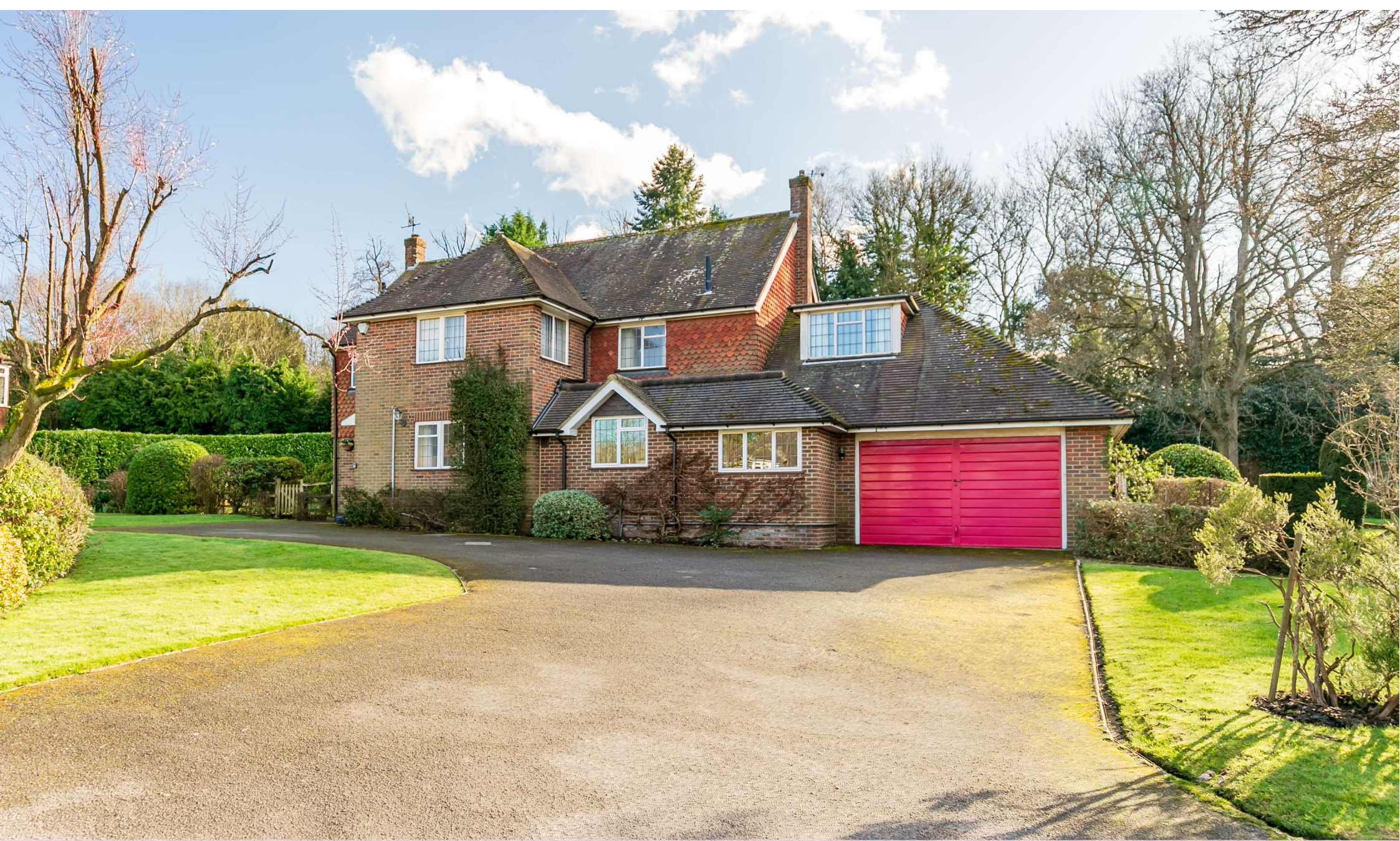
Lapwing House, High Croft, Shamley Green